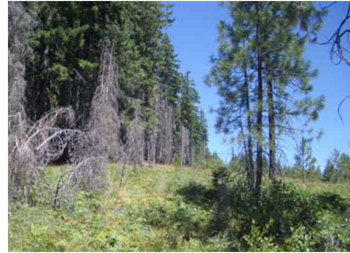
2. The site has been significantly logged over the years, leaving a distinctive boundary to the property.