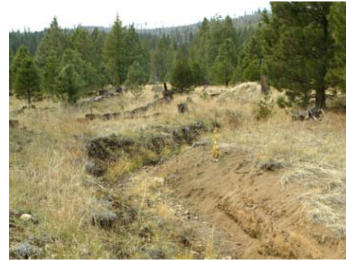
6. Portions of the seasonal drainages have been degraded and incised, providing opportunities for restoration.