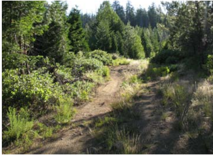
1. Several former logging roads traverse the site.