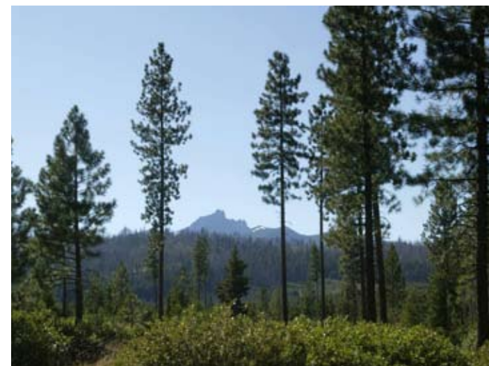
8. Some taller tree stands remain from previous harvests.