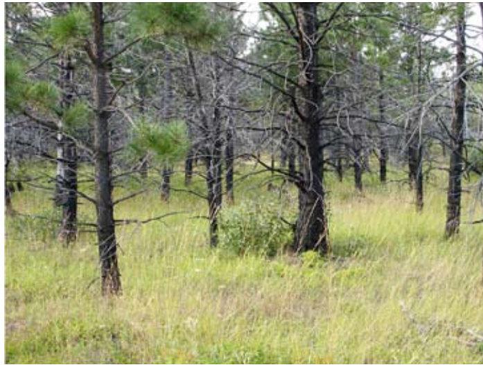
4. The site has been completely logged in the past and some areas of the site were replanted for commercial timber.