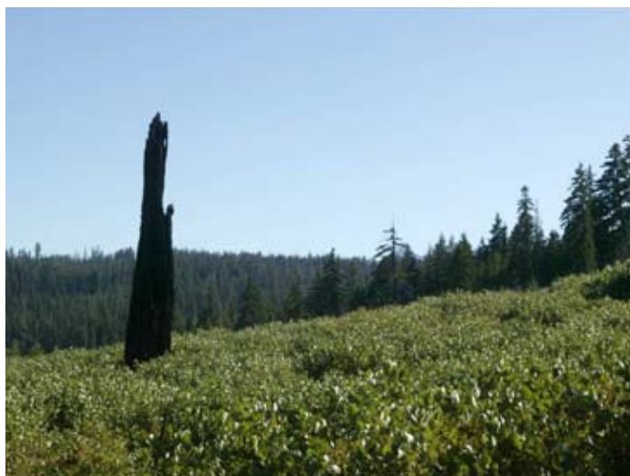
7. Upland open slopes of the site feature low shrubs with a distinct linear property edge.