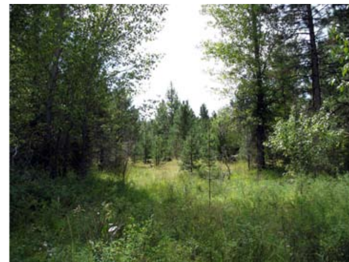
9. The seasonal drainage through the site joins a potential wetland west of FR 1210 in the center of the site.