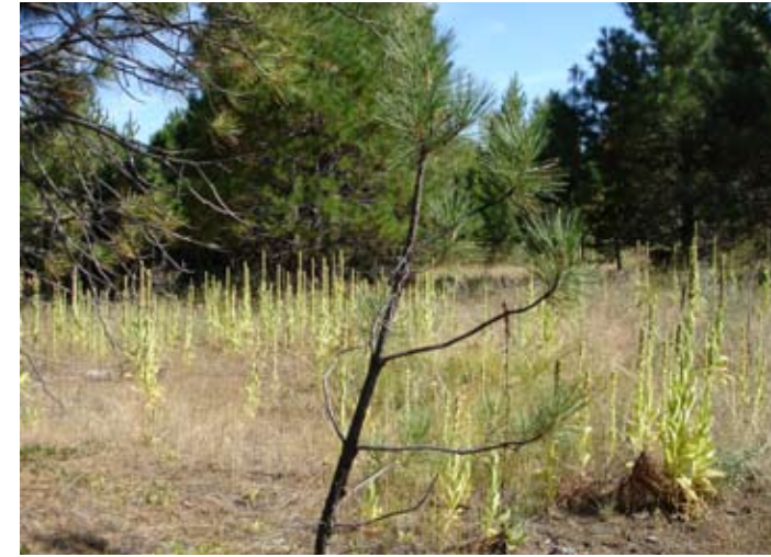
3. The NE corner of the site is gently sloping and features a ponderosa pine plantation with large clearings.