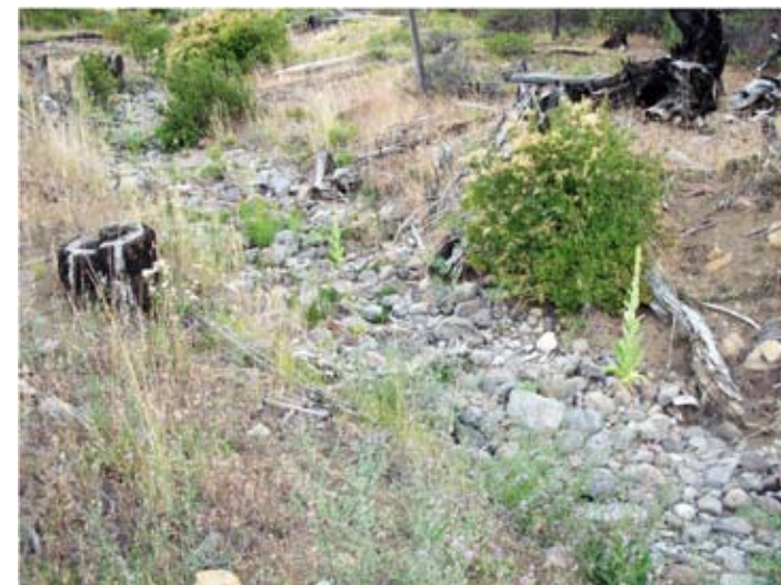
5. The site features two seasonal drainages, which are dry much of the year.